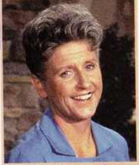
Bad reviews were "funny," said Davis (as Alice).

ALICE The housekeeper embraces a religious life